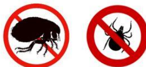
Figure 1: Parex 50mg is effective against ticks and flea infestations amongst cats

the product has shown an acaricidal efficacy against the tick Ixodes ricinus for up to 1 week. If ticks of this species are present on the cat when the product is applied, all the ticks will be killed between 48 hours and one week.